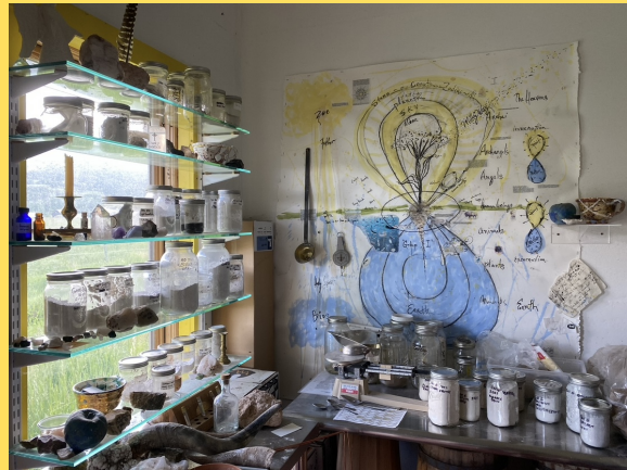
501 Storage at Sustainable Settings, Colorado

"The physical crystal is a transceiver of the sublimely ordered forces streaming from the highest realms.